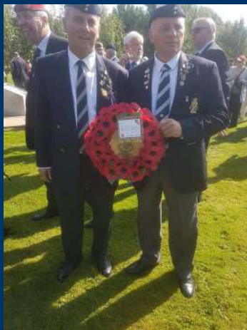
NIVA Parade 14 Sept 2019