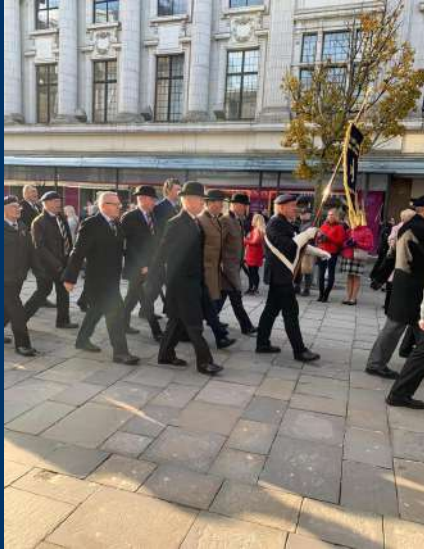
Newcastle upon Tyne