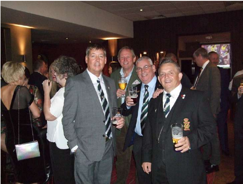
Barnsley Branch reunion 5 October 2019