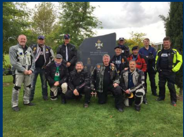
Ride to the Wall 2019