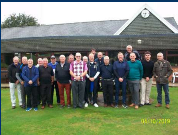
Barnsley Golf 4 October 2019