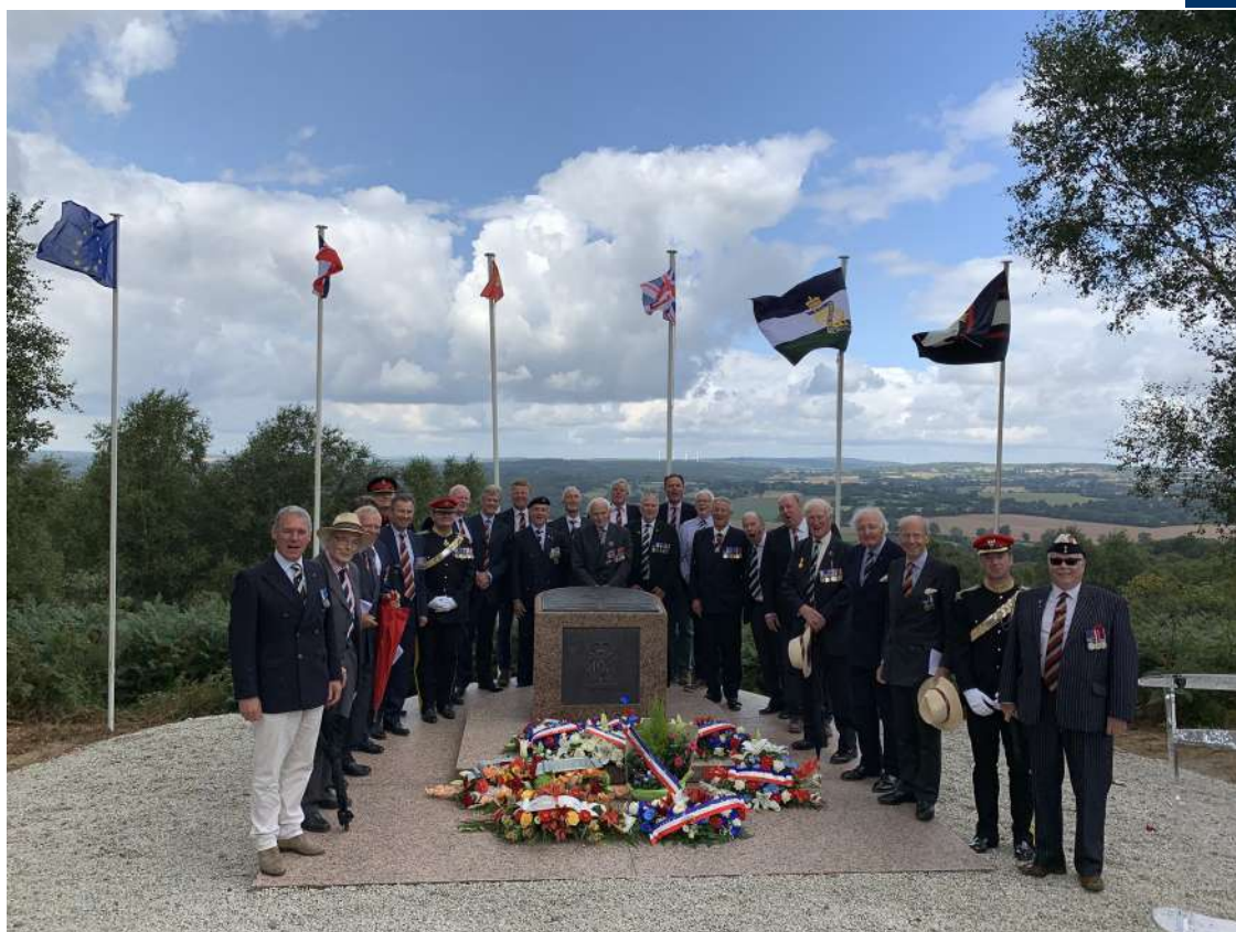
Association members attend the Mont Pincon service 7 August 2020