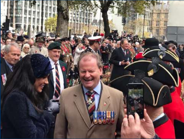
Colonel of the Regiment and In-Pensioners meet the Duchess of Sussex at Field of Remembrance November 2019