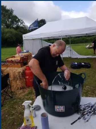
Pan Bash at the Smoker