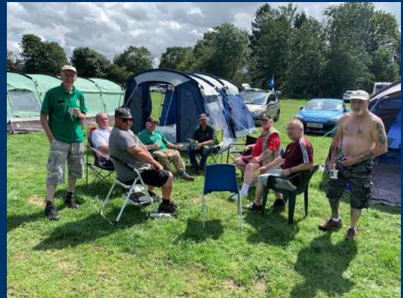
"Now what should we do today?"