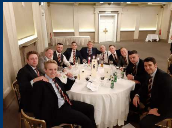
Op HERRICK veterans gather at the Newcastle Dinner 21 Sept 2019