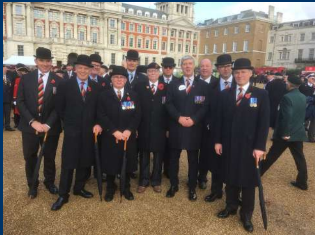
Cenotaph - London